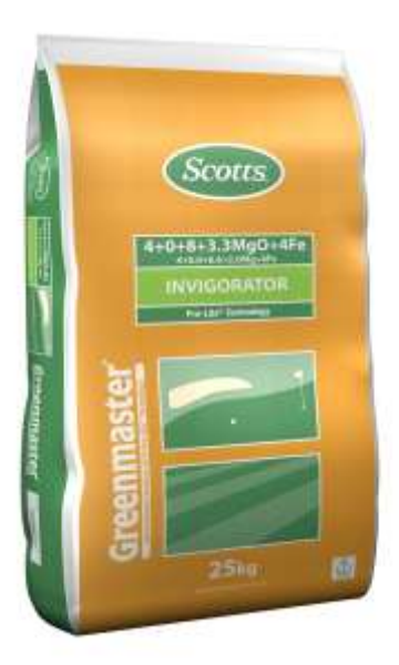
New packaging 2013