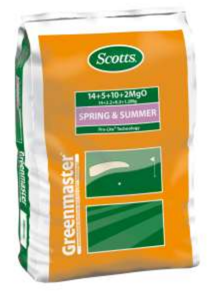
New packaging 2013